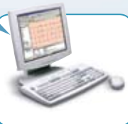
Welch Allyn CardioPerfect™ Workstation Software