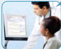
Record test data and patient information to individual patient records in your EMR for analysis and permanent storage