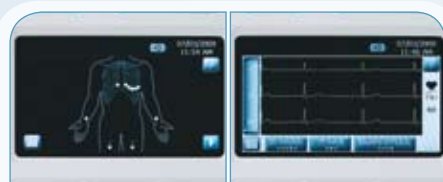
EASY TO FOLLOW

Facilitates one-button operation, guiding you through each test quickly and easily.