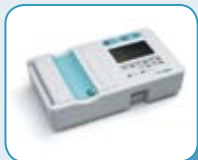
Welch Allyn CP 50 Transfer information via USB